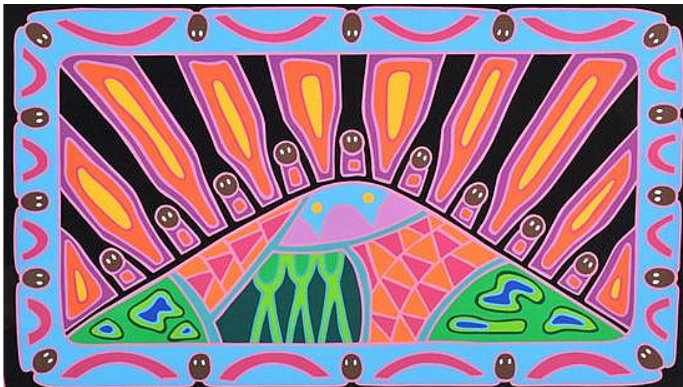
New Day by Sally Morgan, of the Palku and Nyamal peoples of the Pilbara

Acknowledging the truth telling themes, students will all be informed that it is ok to feel strong emotions about the stories (we'd be more worried if they didn't). Visiting teachers will be well-briefed as to the nature of content pre-visit and how to support individual students. Aboriginal or Torres Strait Islander students will be briefed by Birrigai staff or IEO staff from the visiting school and options identified for all students if content is distressing to them.